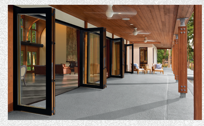
Flexible designs and striking lines expand your modern lifestyle.