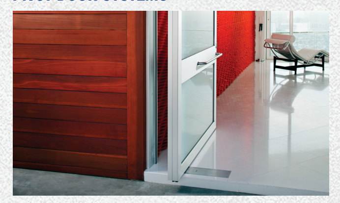
Precision-engineered for ease of motion across big, bold entryways.