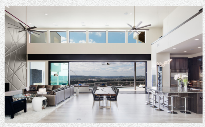
Strength and symmetry define seamless movement across living spaces.