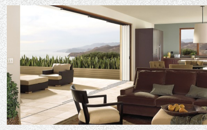
Make the boundaries disappear for wide open living.