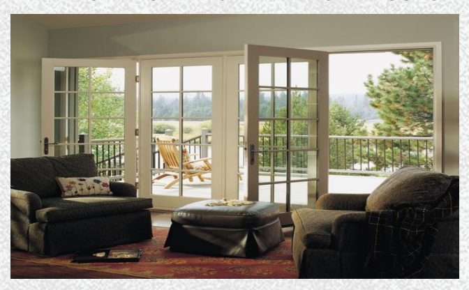
Timeless beauty for classic rooms in everyday living.