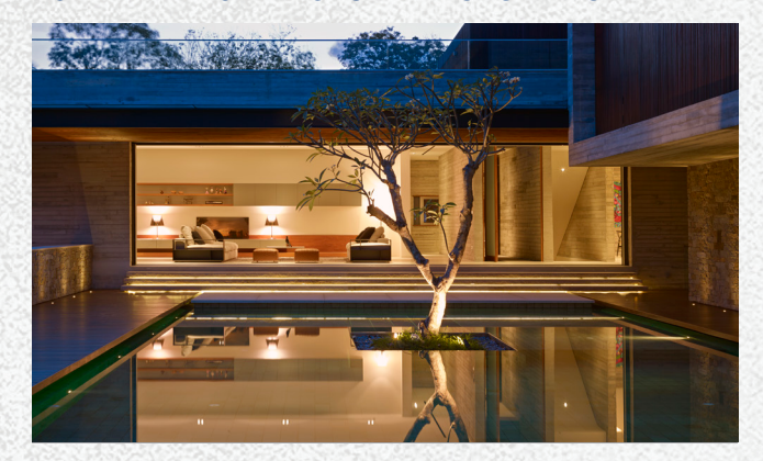
Dramatic dimensions and sweeping lines for custom, showstopping spaces.