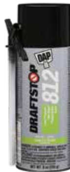
DAP® DRAFTSTOP® 812 Window and Door Foam