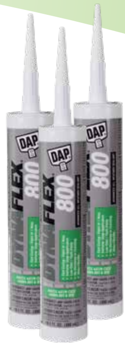
DAP® DYNAFLEX® 800 Sealant