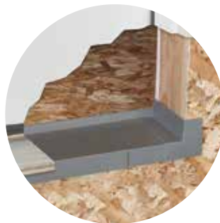
Jamsill Guard® Sill Pan