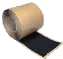
DAP® LT Poly Flash 711

Jamsill Guard is a registered trademark of Jamsill, Inc. - Talent, OR