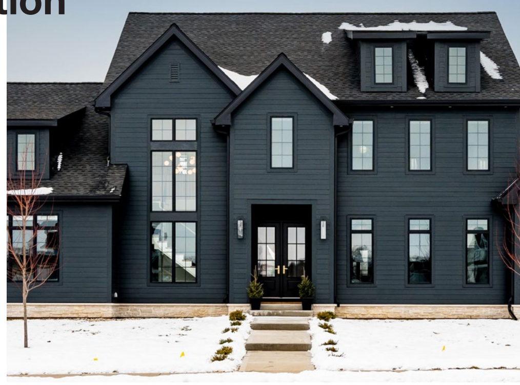
Hardie® Plank Shou Sugi Ban Hardie® Trim Shou Sugi Ban

See what's possible at jameshardie.com/dream