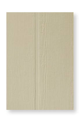
Size 4 ft x 8 ft 9 ft 10 ft Statement Collection™ Dream Collection™ Prime • • •