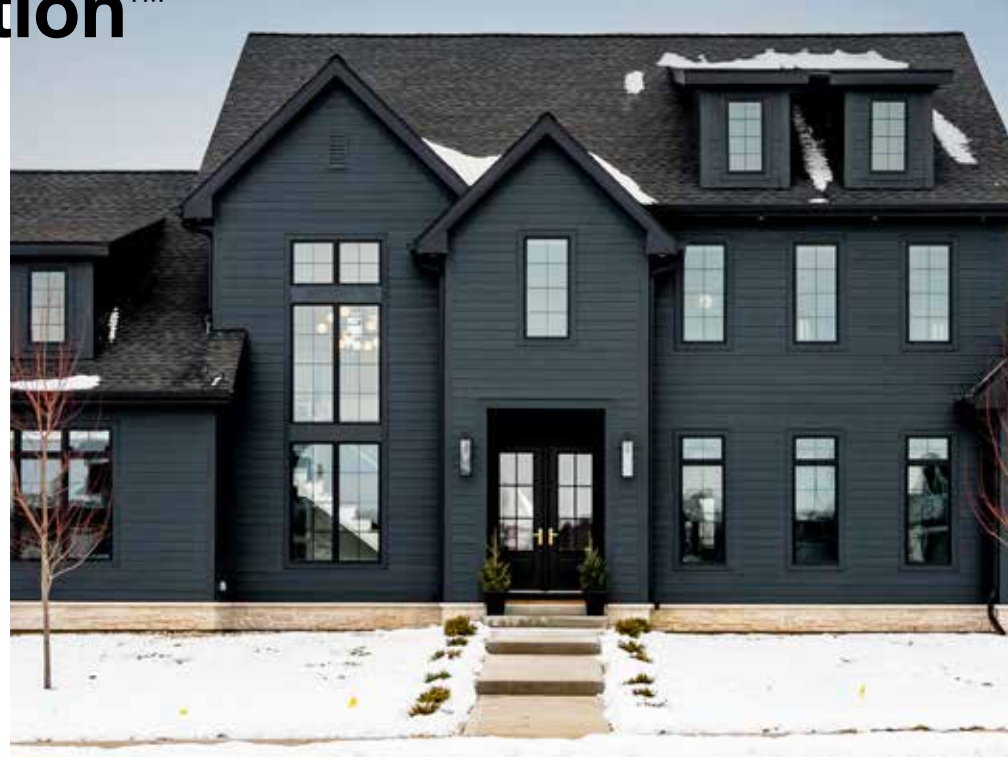
Hardie® Plank Shou Sugi Ban Hardie® Trim Shou Sugi Ban

See what's possible at jameshardie.com/dream