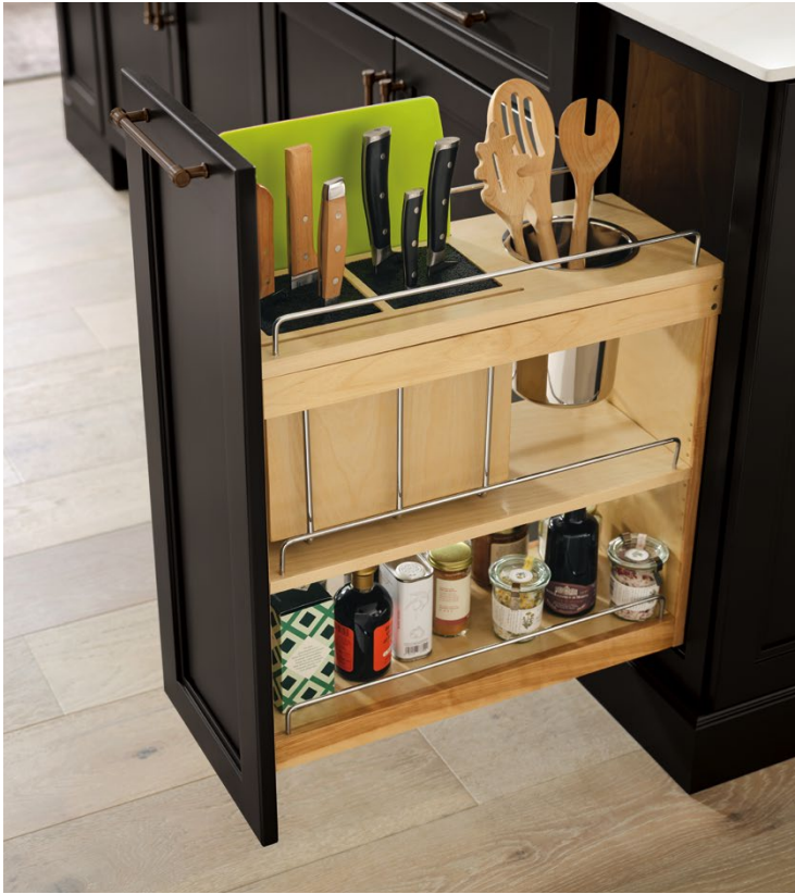
Interchangeable Base Pull-Out