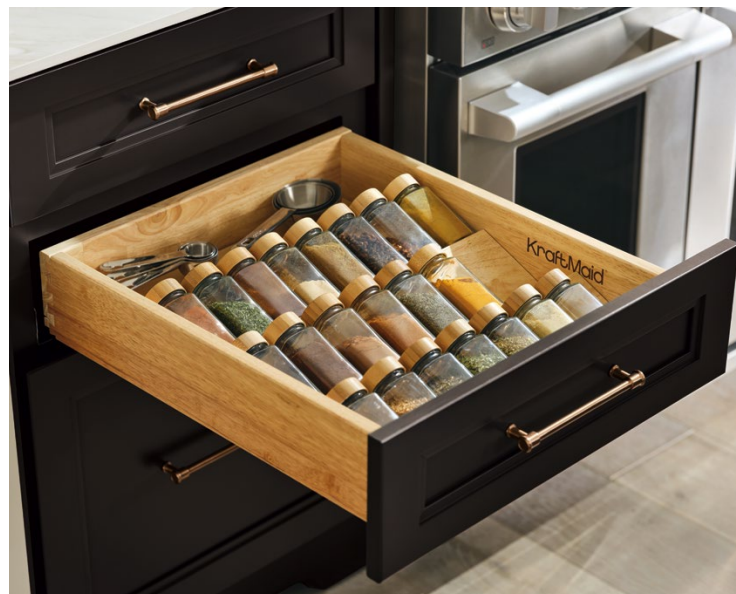
Spice Drawer Organizer