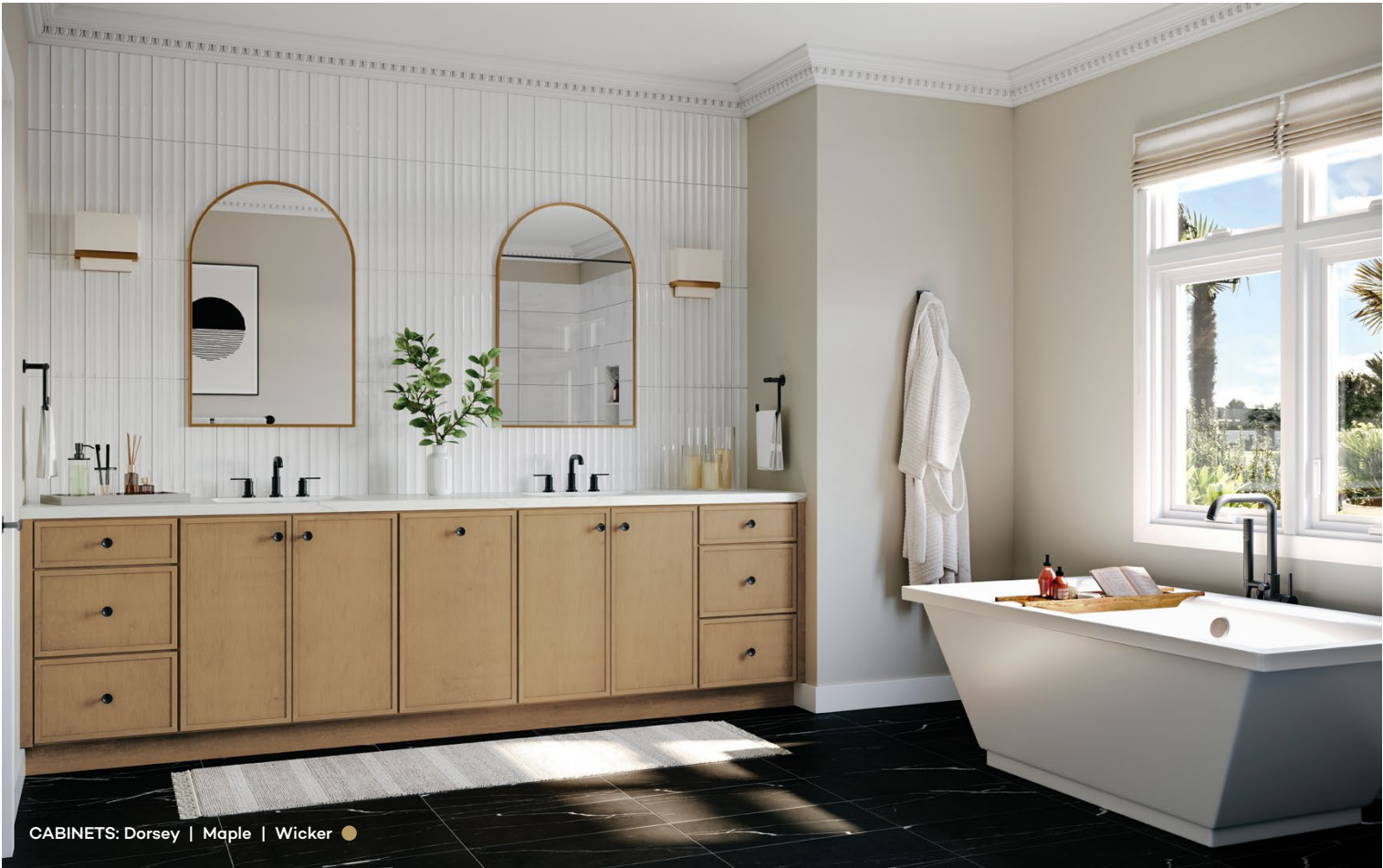
CABINETS: Dorsey | Maple | Wicker ●