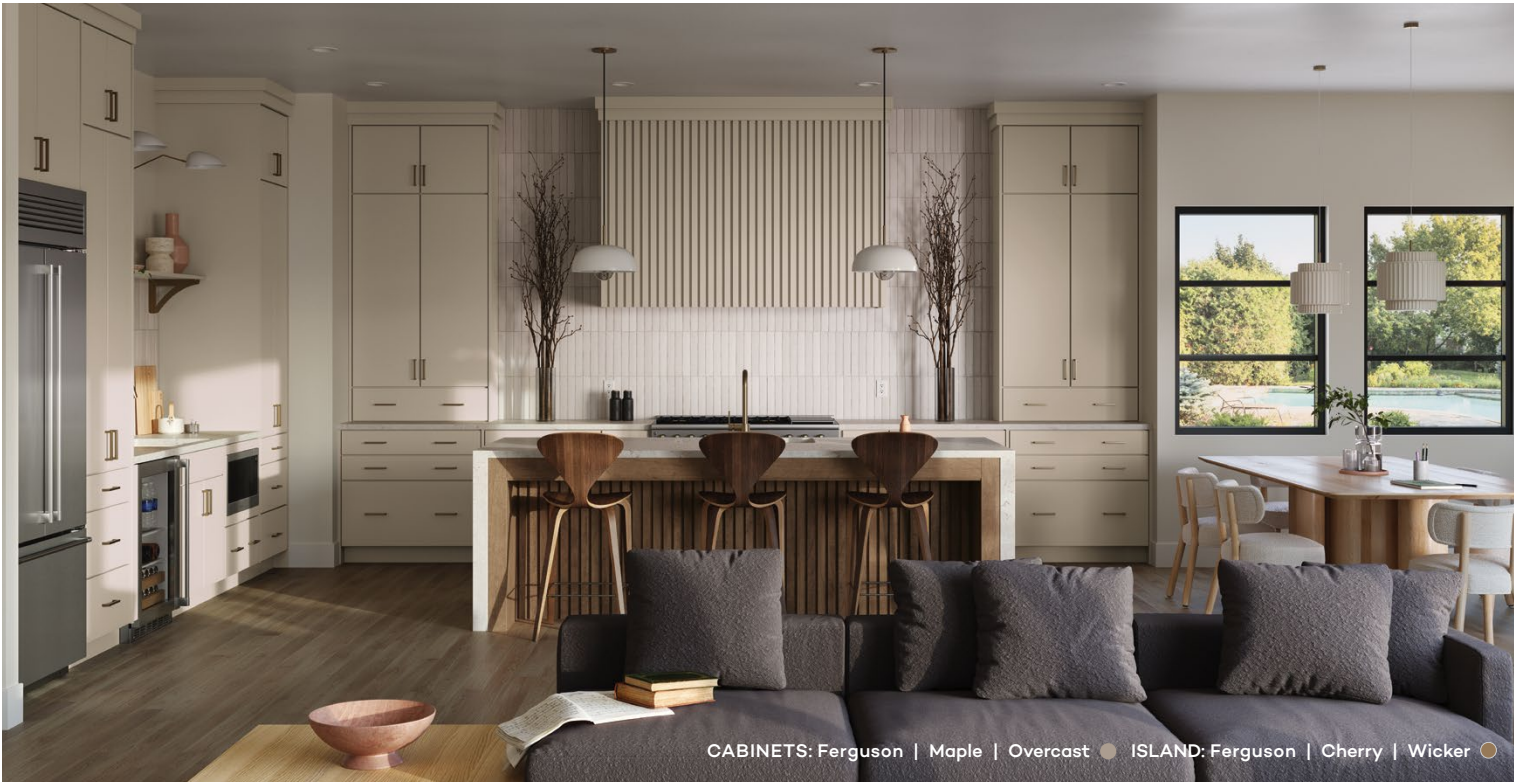
CABINETS: Ferguson | Maple | Overcast ● ISLAND: Ferguson | Cherry | Wicker ●