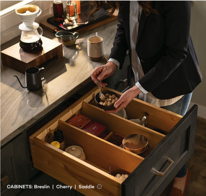
CABINETS: Breslin | Cherry | Saddle ○

Every moment in your home is better when it's designed around the life you want to live. Get more ideas at kraftmaid.com/spaces .