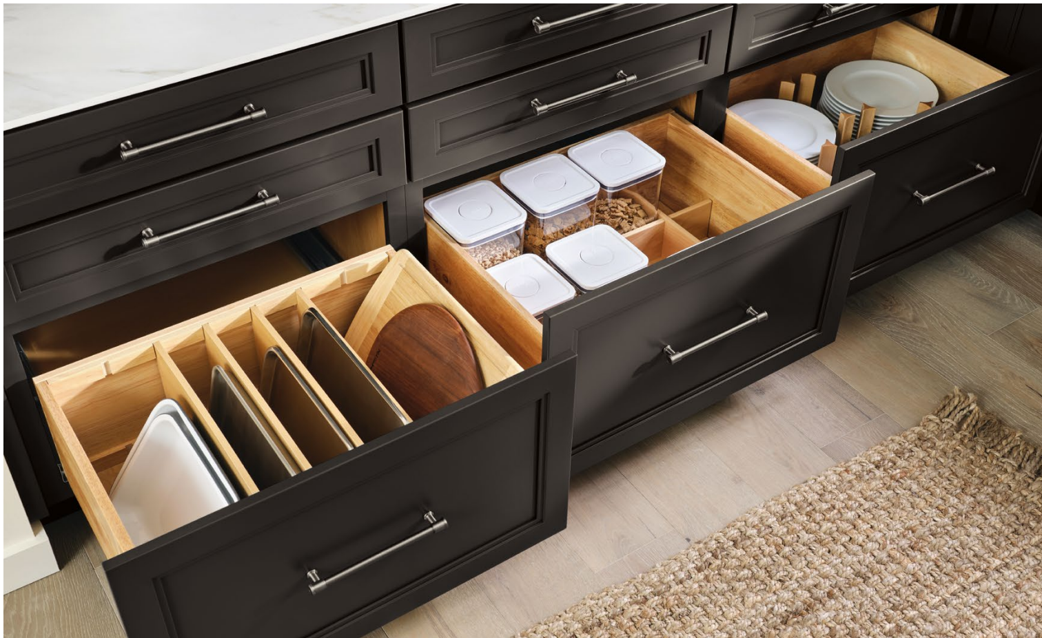
Deep Drawer Options

For everything you have. And for the kind of buttoned-up, organized feeling you want. Find more clever storage ideas at kraftmaid.com/accessories .