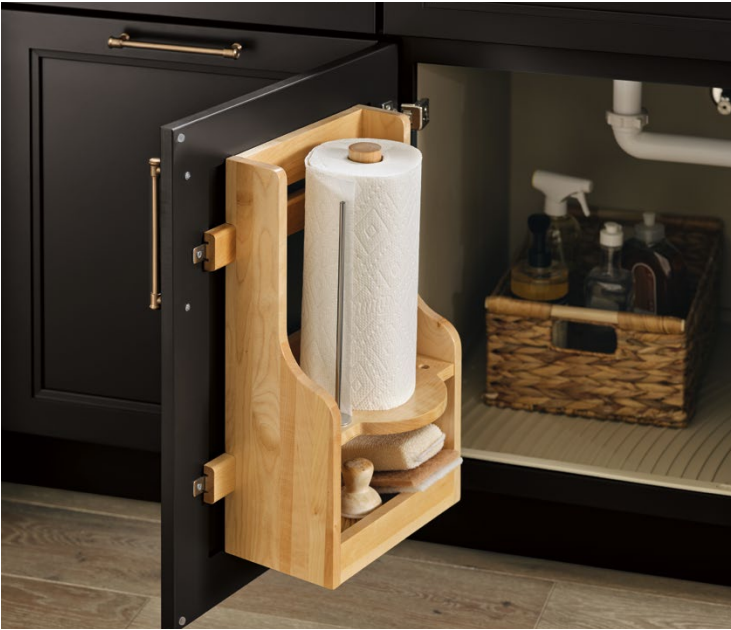
Sink Base Paper Towel Storage