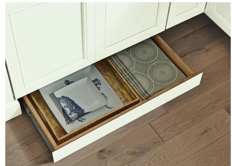
Toe Kick Drawer