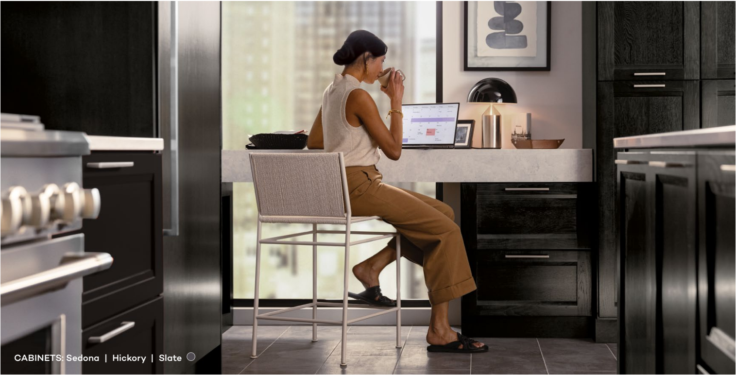
CABINETS: Sedona | Hickory | Slate ○