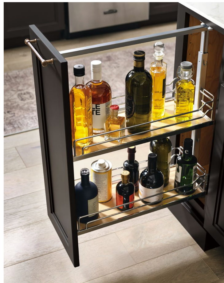
Chrome Base Pull-Out