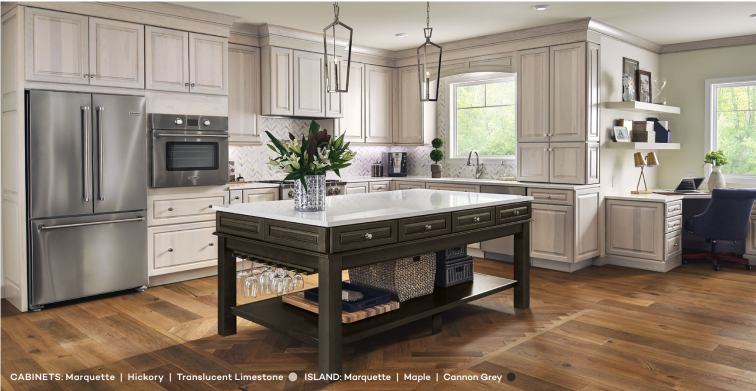
CABINETS: Marquette | Hickory | Translucent Limestone ● ISLAND: Marquette | Maple | Cannon Grey ●