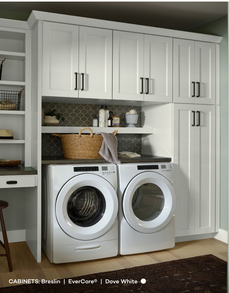
CABINETS: Breslin | EverCore® | Dove White ●