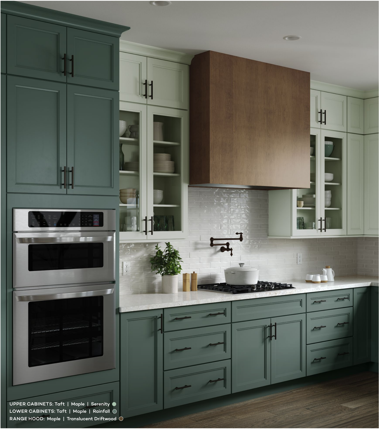
UPPER CABINETS: Taft | Maple | Serenity ● LOWER CABINETS: Taft | Maple | Rainfall ○ RANGE HOOD: Maple | Translucent Driftwood ○