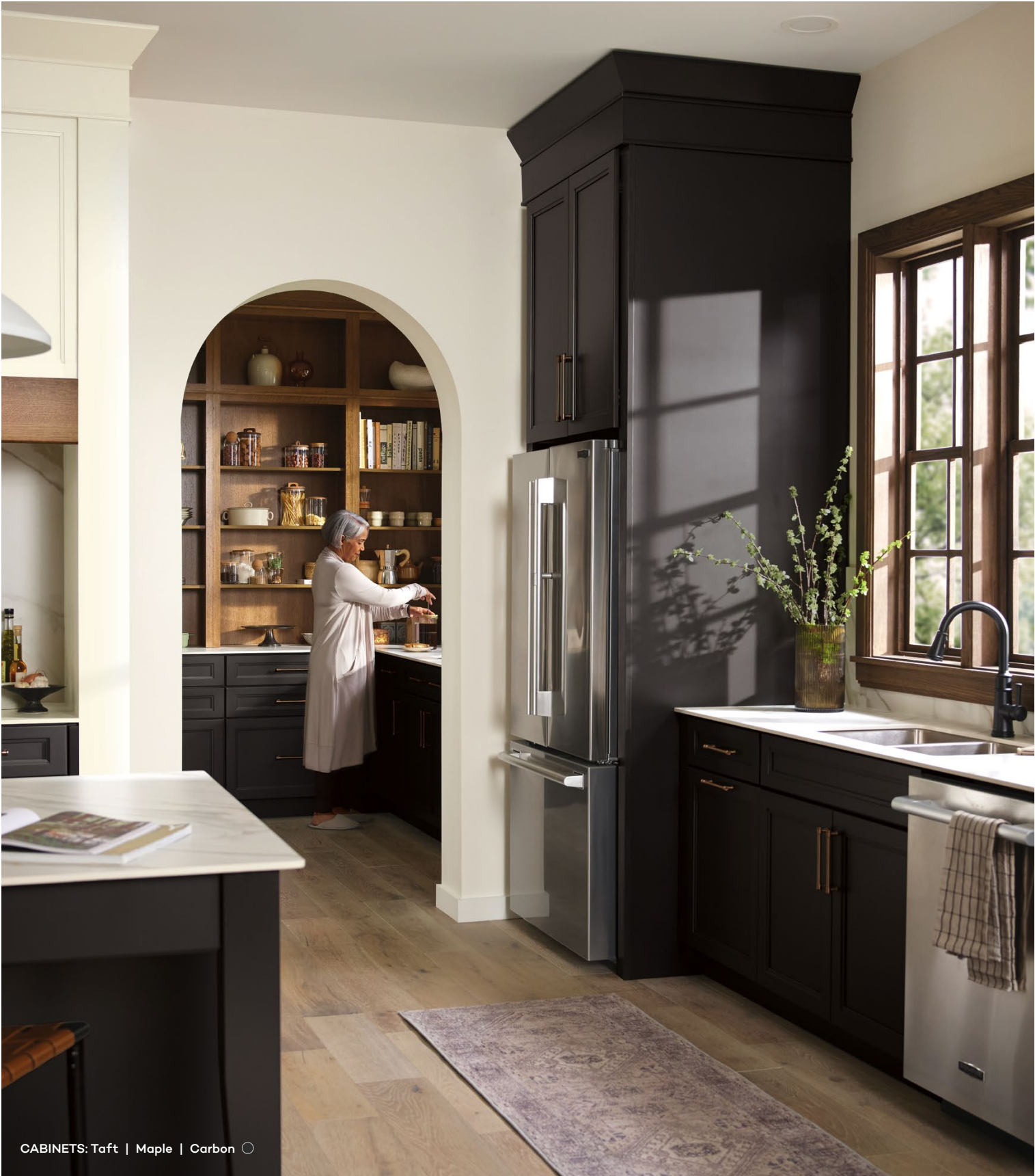
CABINETS: Taft | Maple | Carbon ○