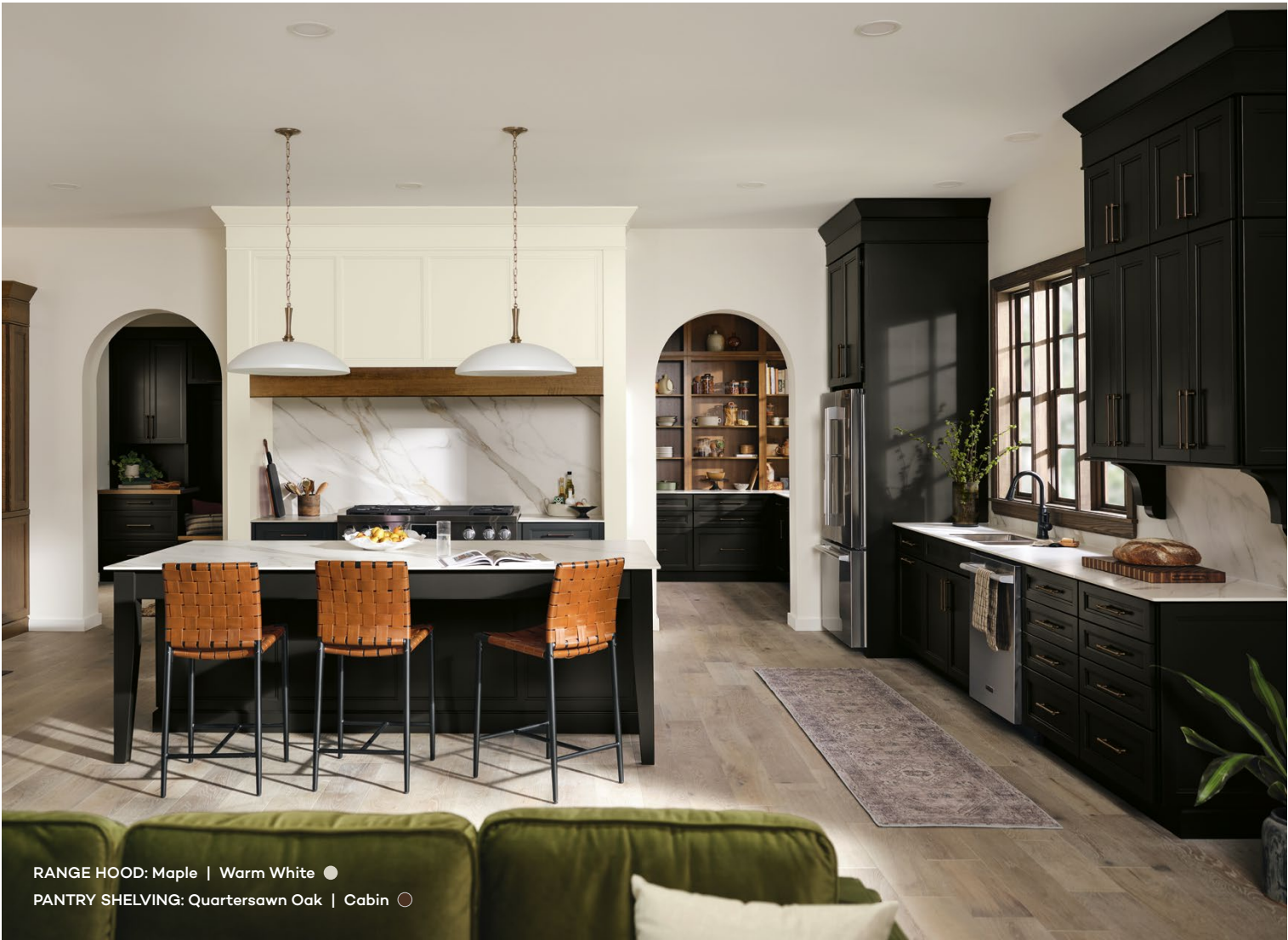
RANGE HOOD: Maple | Warm White ● PANTRY SHELving: Quartersawn Oak | Cabin ○