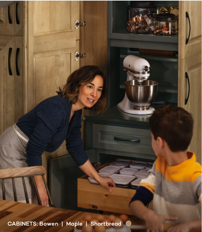
CABINETS: Bowen | Maple | Shortbread ●