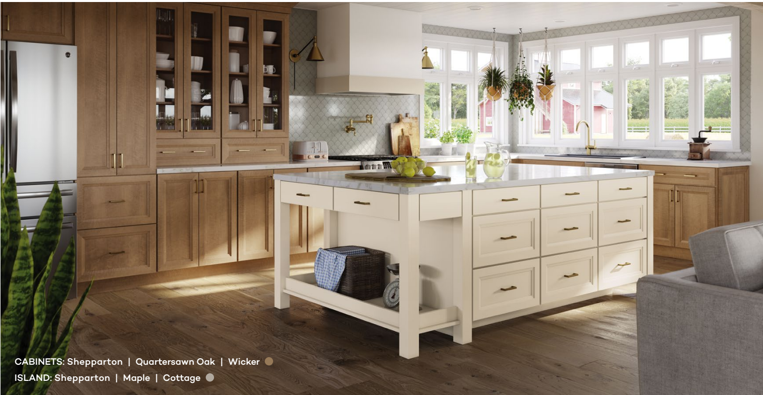
CABINETS: Shepparton | Quartersawn Oak | Wicker ● ISLAND: Shepparton | Maple | Cottage ●