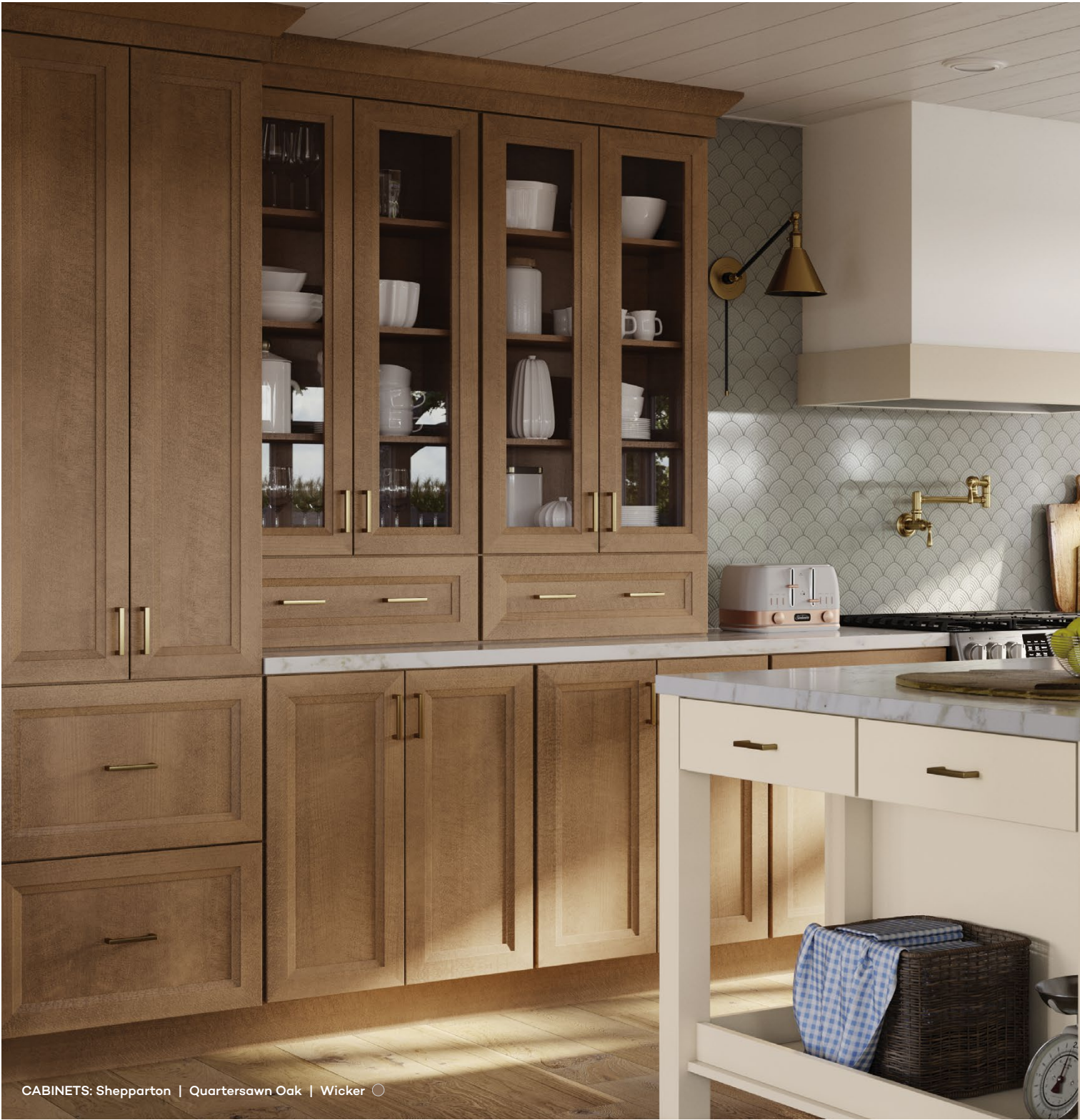
CABINETS: Shepparton | Quartersawn Oak | Wicker ○

Hand-rubbed to bring out wood's natural beauty.