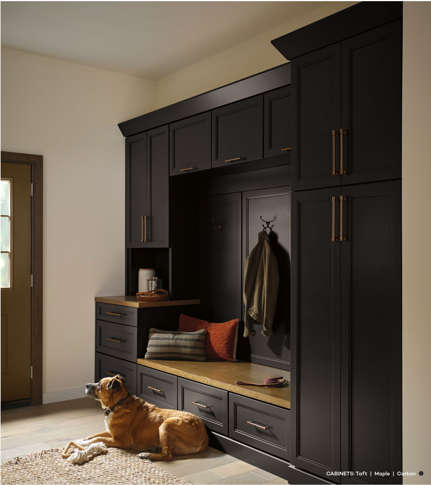
CABINETS: Taft | Maple | Carbon ●

Why stop at the kitchen? Transform any space that could use more style and storage.