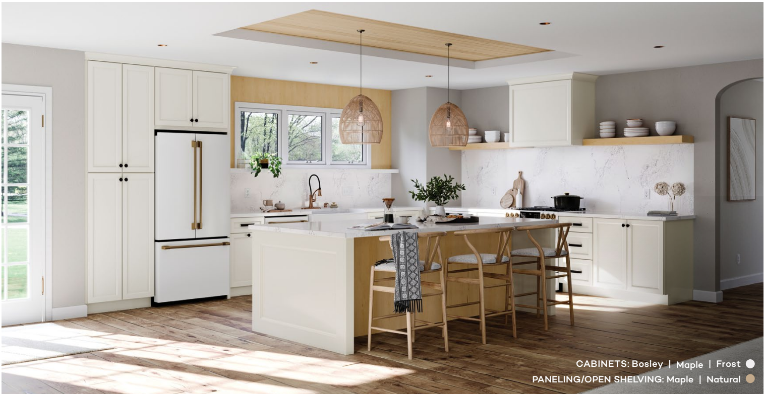
CABINETS: Bosley | Maple | Frost ● PANELING/OPEN SHELVING: Maple | Natural ●