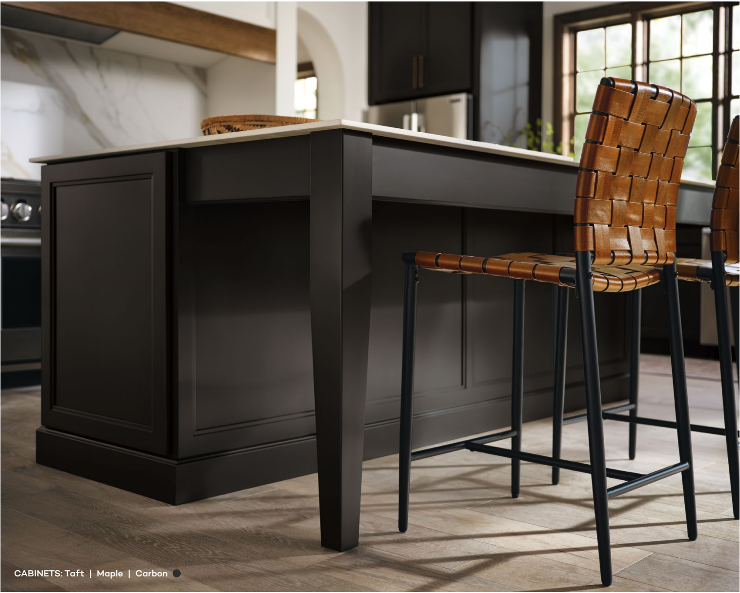
CABINETS: Taft | Maple | Carbon ●

On-trend colors that express your personality.