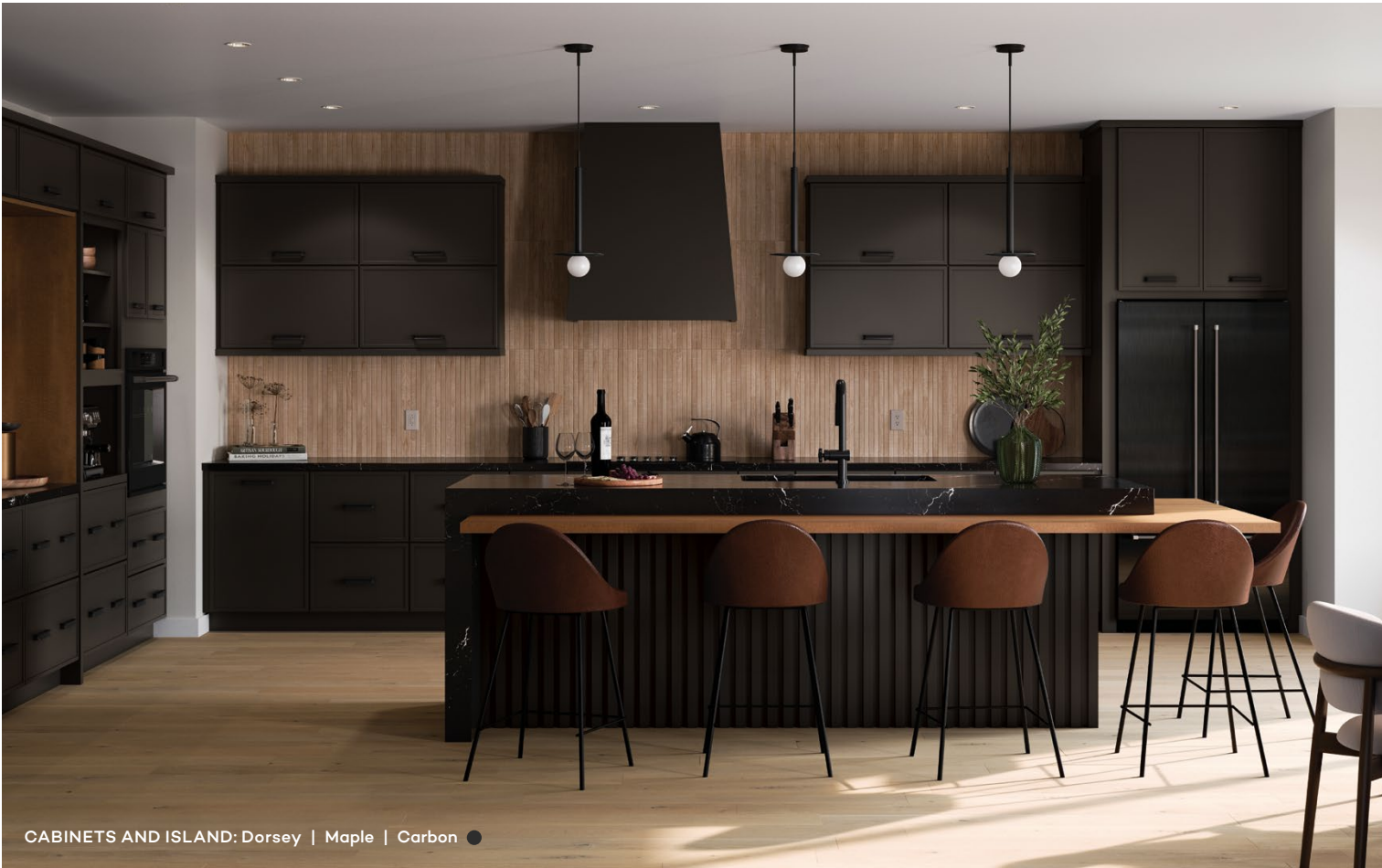
CABINETS AND ISLAND: Dorsey | Maple | Carbon ●