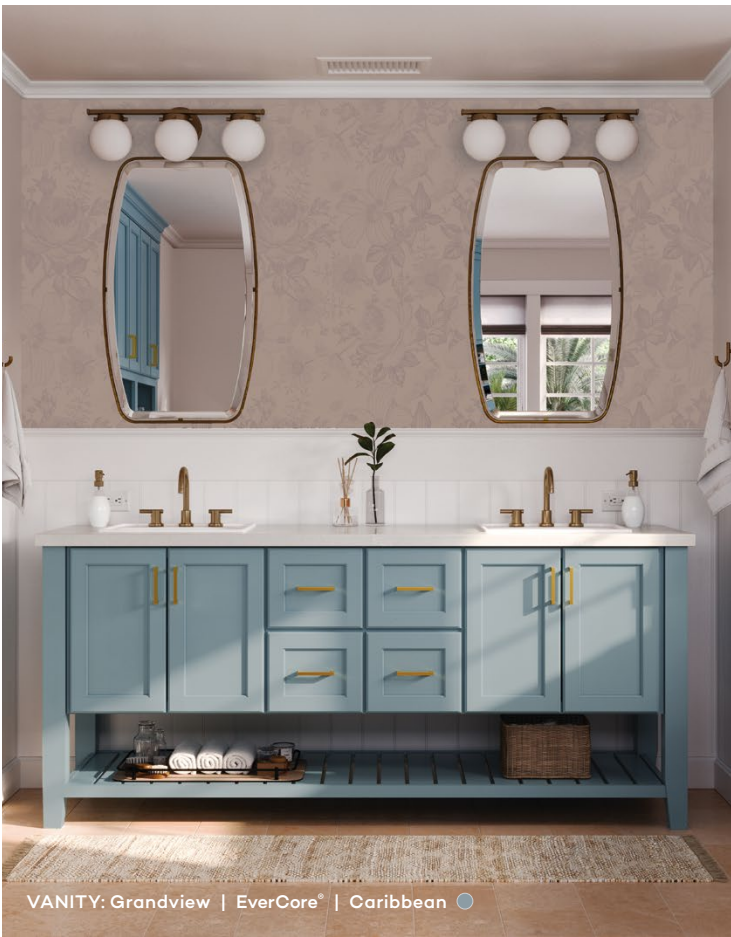
VANITY: Grandview | EverCore® | Caribbean ●