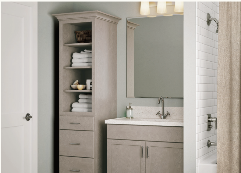
Door Style: Westly Finish: Steel Grey Stain