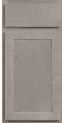
Steel Grey Stain