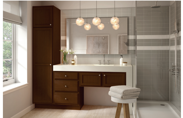
Door Style: Colony Finish: Pecan Stain