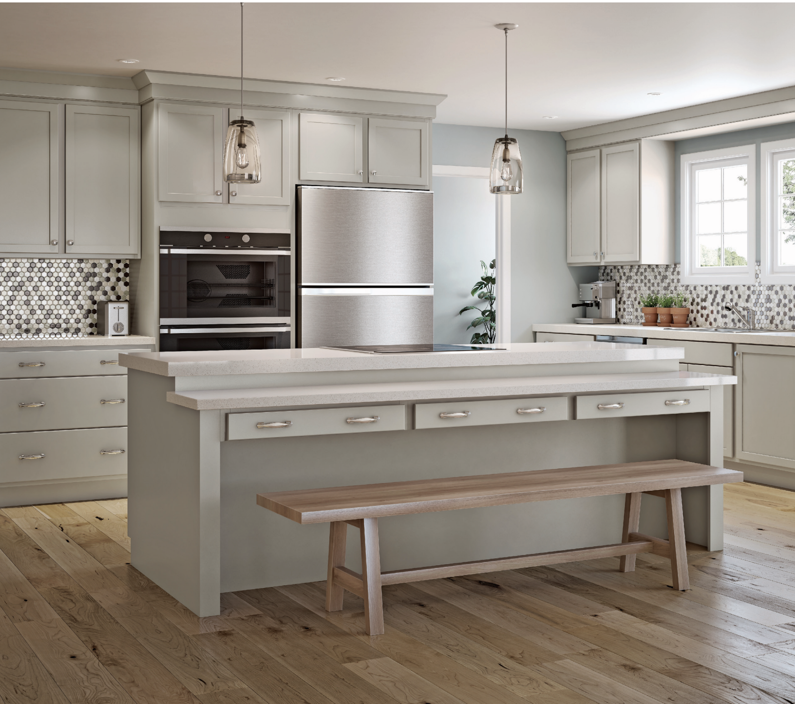
Door Style: Collins Finish: Shale Paint