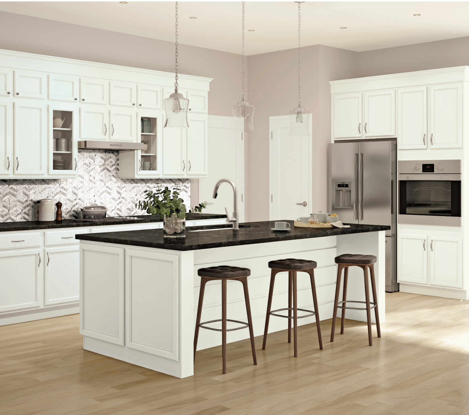
Door Style: Colony Finish: Cotton Paint