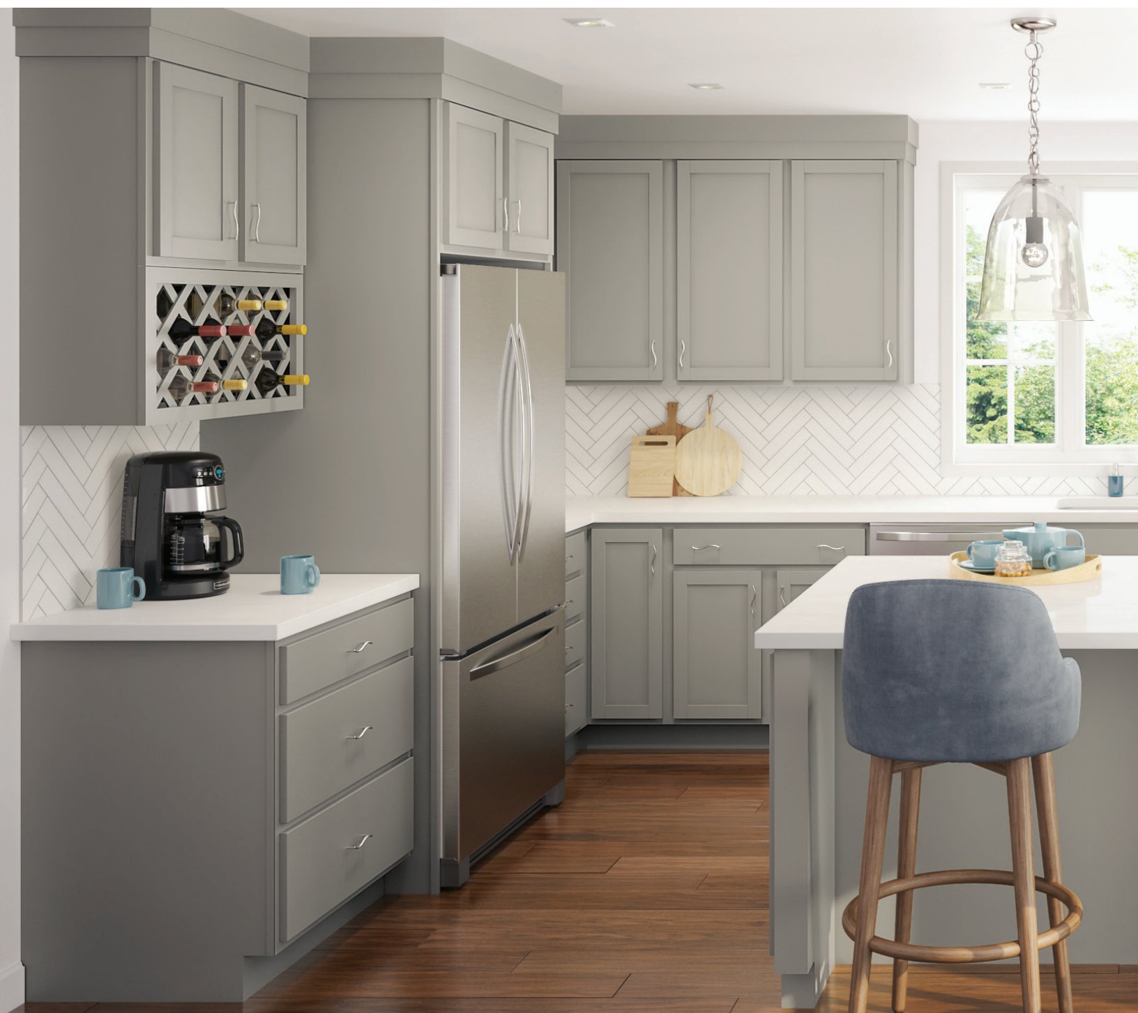
Door Style: McDurmon Finish: Grey Laminate