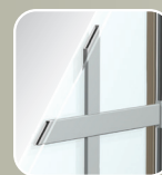
3/4" Flat, 5/8" or 1" Sculptured