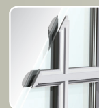
7/8" or 1-1/4" SDL with Shadow Bar