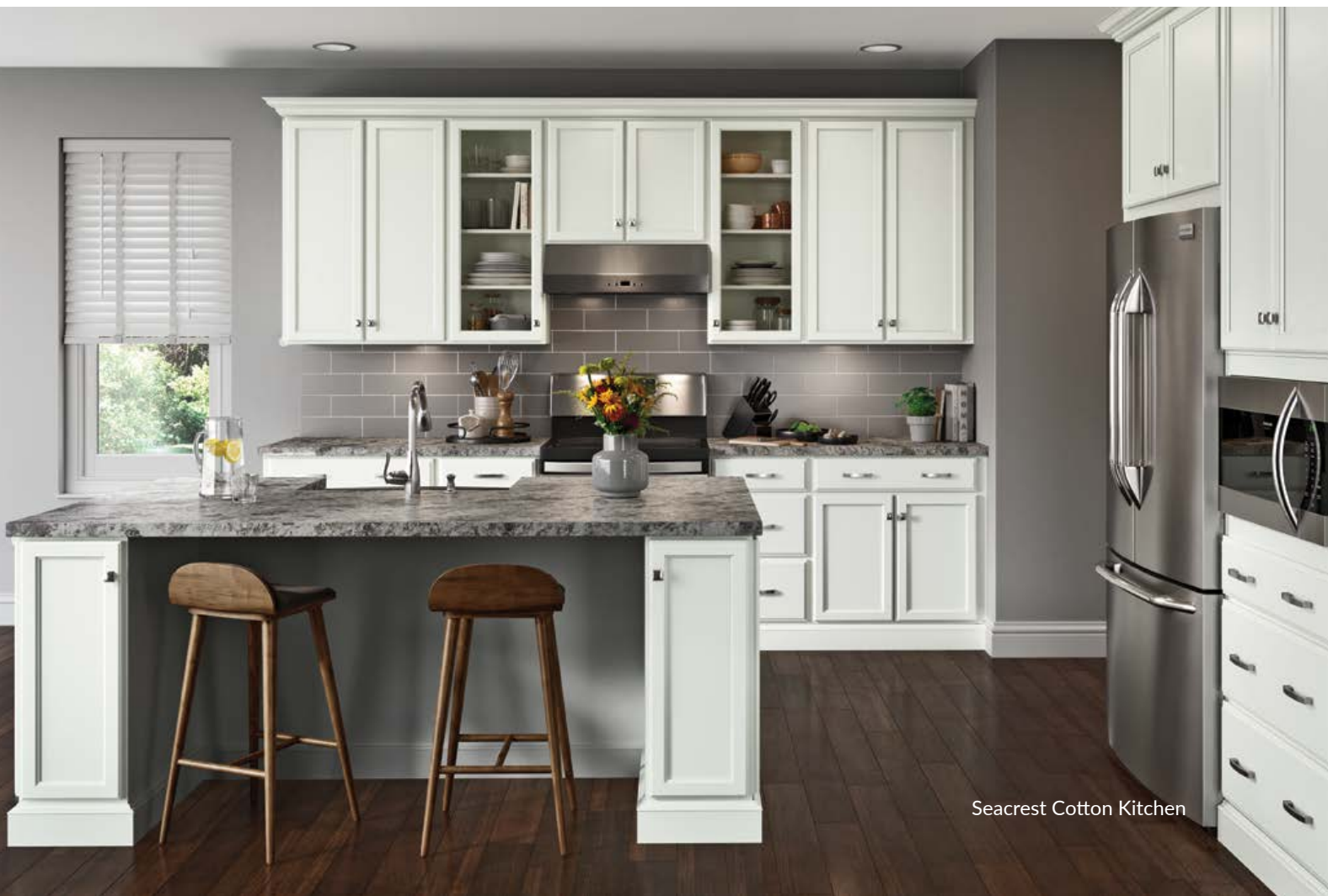
Seacrest Cotton Kitchen