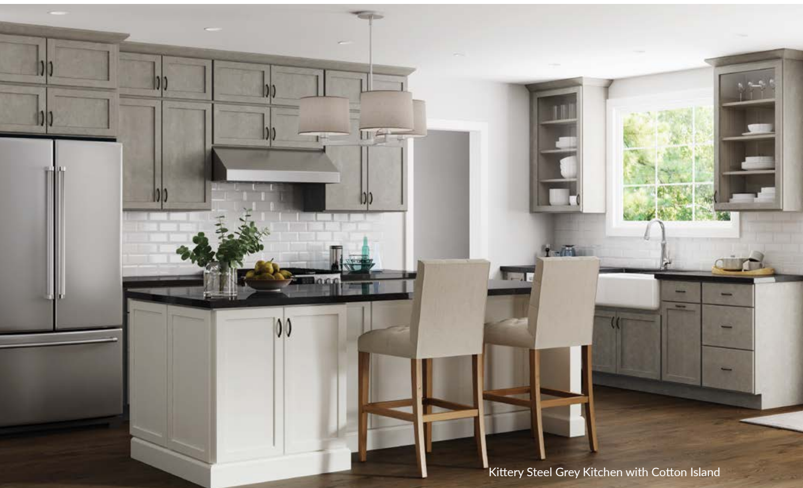
Kittery Steel Grey Kitchen with Cotton Island