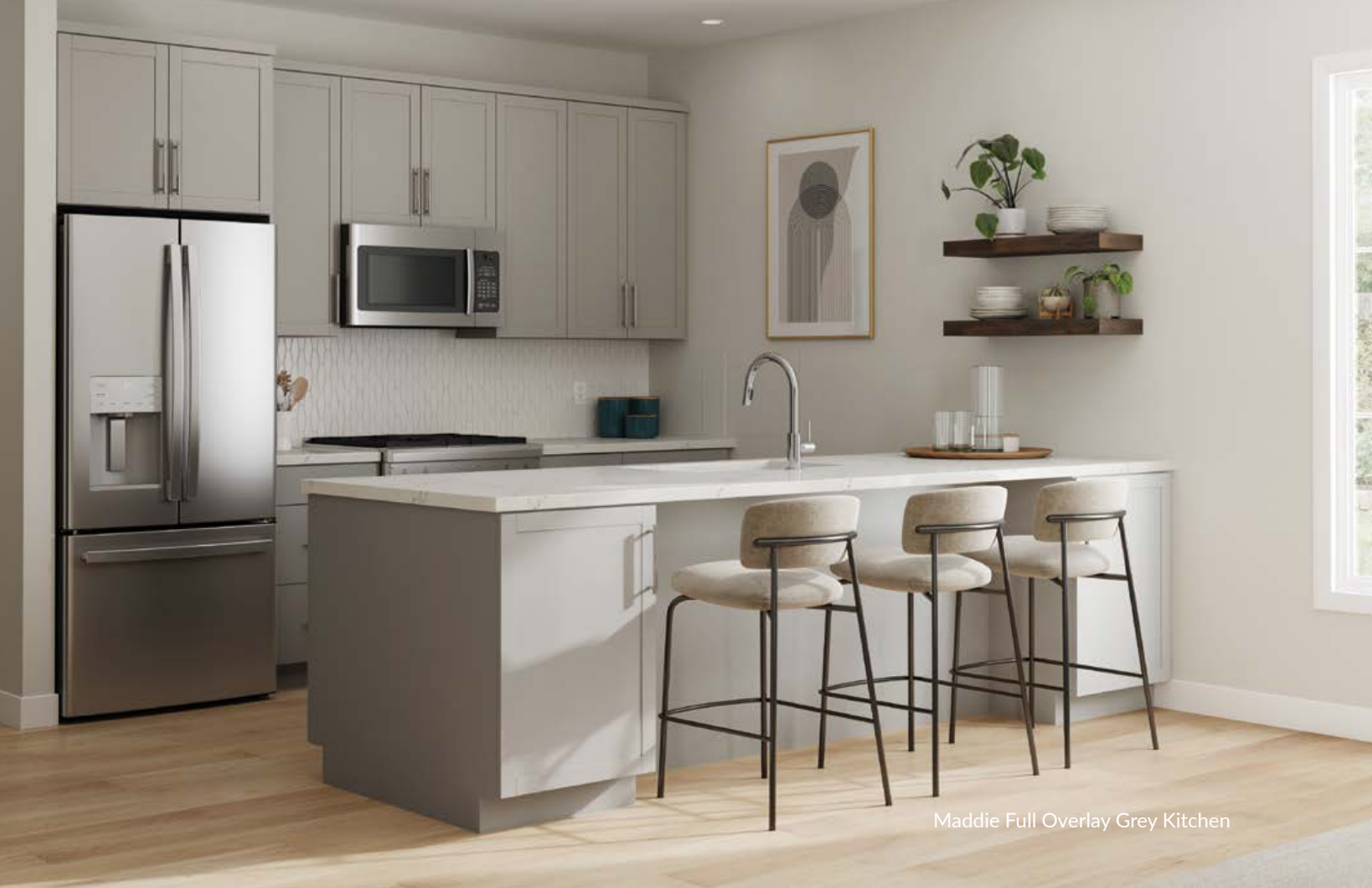
Maddie Full Overlay Grey Kitchen