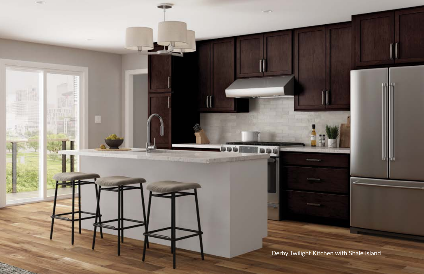
Derby Twilight Kitchen with Shale Island