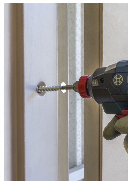
Application in hollow metal door frame.

Suggested fixture hole sizes are for structural steel thicker than 12 gauge only. Larger holes are not required for wood or cold-formed steel members.