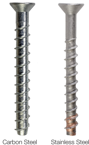
Carbon Steel Stainless Steel