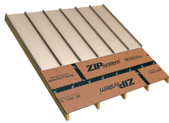
Metal Shingles & Panels