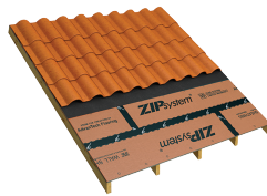
Clay & Concrete Tile

To locate a dealer call 1.800.933.9220 or visit ZIPsystem.com/Roof